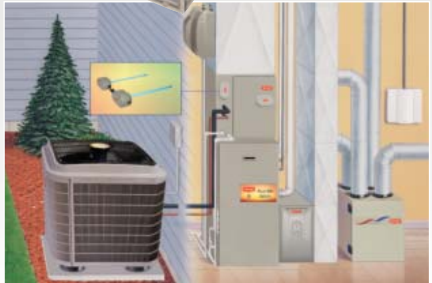
HYBRID HEAT™ Deluxe Heat Pump and Deluxe Gas Furnace System